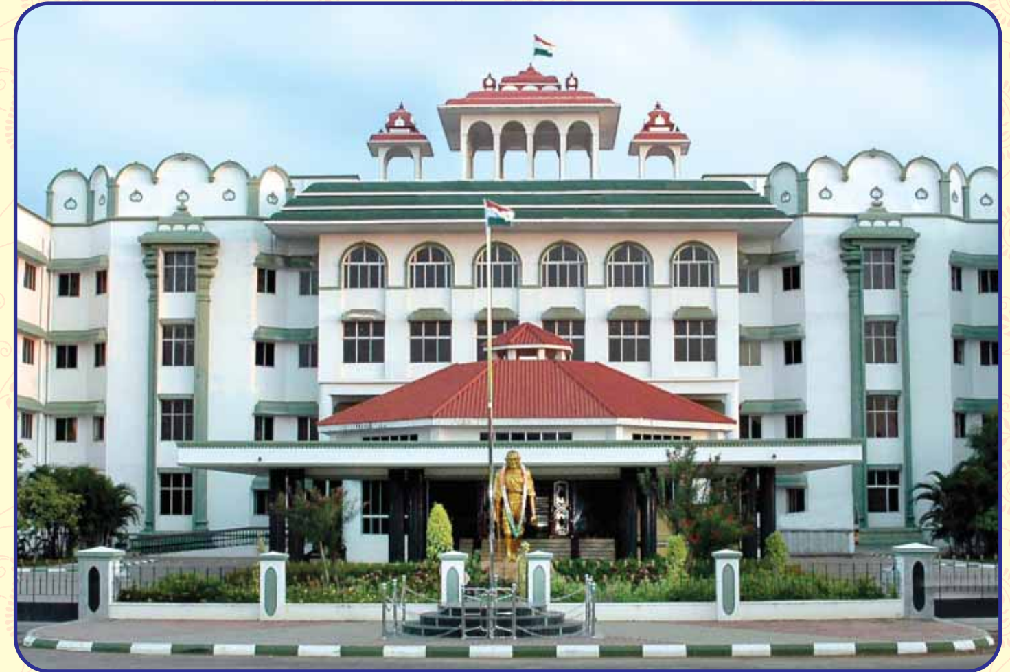
Madurai Bench of Madras High Court